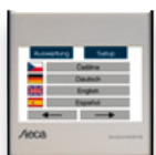
StecaGrid Monitor Data logger