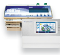
Meteocontrol WEB'log and Meteocontrol WEB'log Comfort Data logger