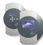
Solar-Log 500/1000™ Data logger