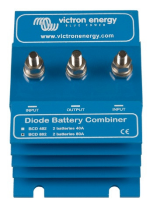
Argo Diode Battery Combiner BCD 802

Diode battery combiners are used to guarantee continuous DC power to mission critical equipment, such as an electronic engine control system. With a diode battery combiner two or more DC power sources can be used in parallel to supply the mission critical load. Failure of one source will not interrupt power to the critical load.